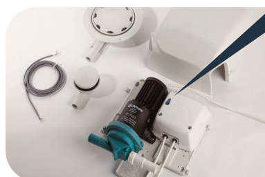
Sika Flow Sensor SDS263T