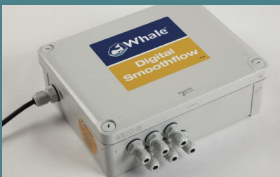
Digital Smoothflow Control Box (SDS243T)