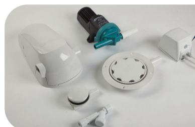
Wet Floor and Tray Gulley kit BP1578