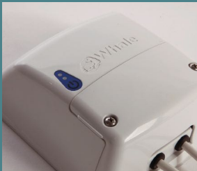
Instant Match Transformer with Bluetooth Technology (SDS236T)