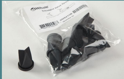
Tricuspid Valves X 10 (SDS211B)