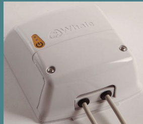
Instant Match transformer with wireless technology (SDS131T - 755.549)