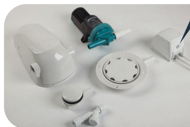
Wet Floor and Tray Gulley kit BP1578