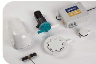
Digital Smoothflow Kit SDP113T