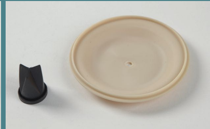
Diaphragm/Valve Kit (SDS061T)