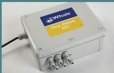
Dry-Deck Control Box (SDS273T)