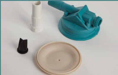
Spare Pump Head Kit (SDS071T)