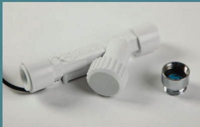
Mixer Valve Conversion Kit (AK1570)