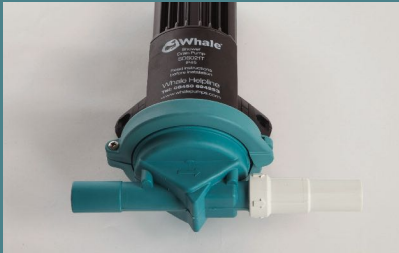
Shower Drain Pump (SDS021T)