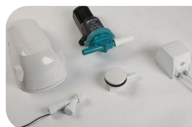
Tray Gulley kit BP1558B