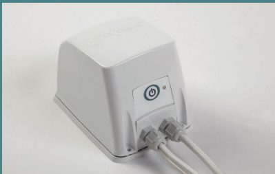
Switch Connect Transformer (SDS081T)