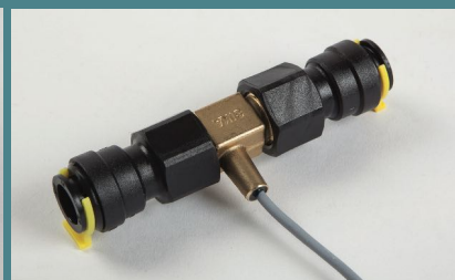
Sika Flow Sensor (SDS263T) (May also be used with the Instant Match and any electric shower)