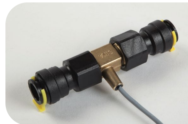
Sika Flow Sensor SDS263T