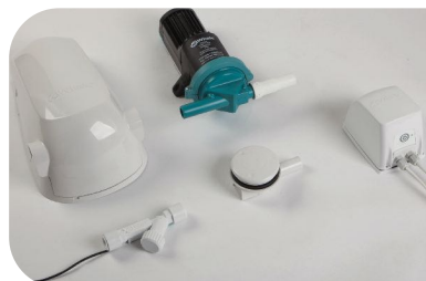
Tray Gulley kit BP1558B