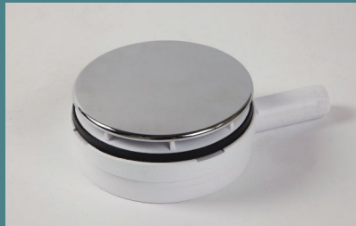
90mm Tray Gully (AK1695)