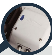
Whale Instant Match ® Kit SDP134T

Active Link Includes Active Link technology