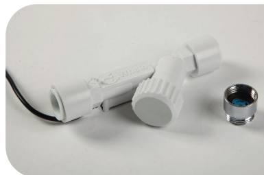
Mixer Valve Conversion Kit AK1570