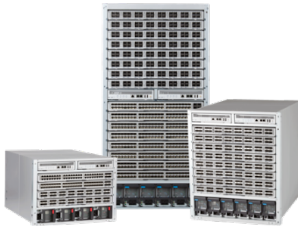
Arista 7300 Series