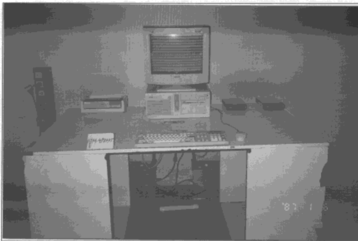
FRONT VIEW OF CONDUCTED TEST