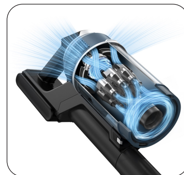
Advanced Cleaning Performance