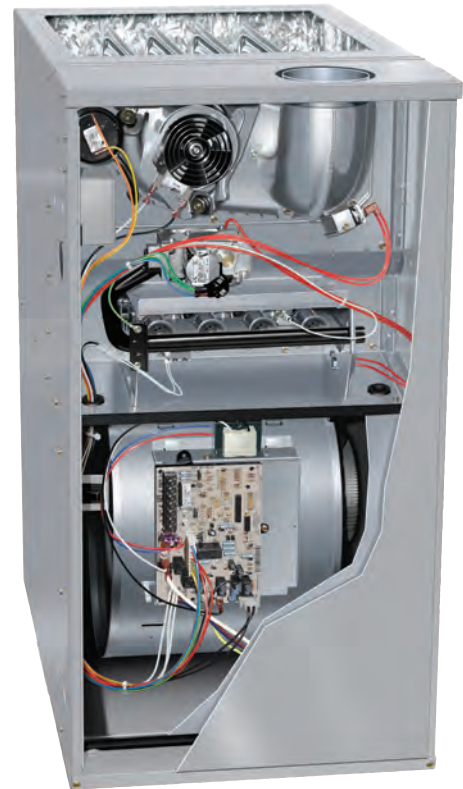
N80 Gas Furnace

Tempstar gas furnaces are designed for durability and comfort. The warmth and efficiency of natural gas combined with a quiet, efficient blower motor delivers comfort throughout the cold seasons. The gas furnace can also be combined with an indoor evaporator coil and properly matched outdoor air conditioner or heat pump to provide cooling during the warm seasons.