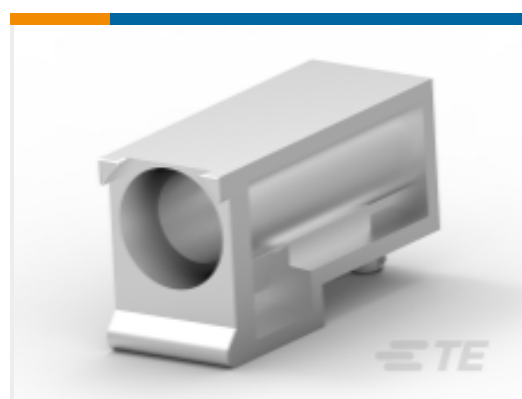
TE Part # 1-1469492-9 MULTIGIG RT 9MM GUIDE/ESD UNKE