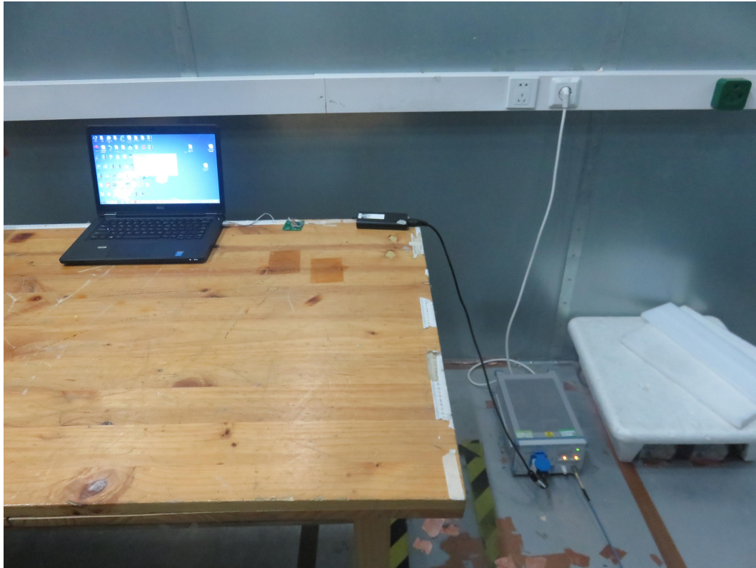
Picture 3 Conducted Emission Test Setup