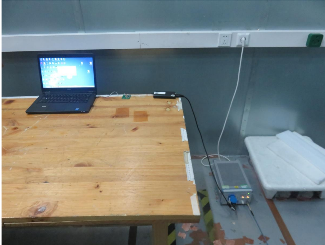
Picture 3 Conducted Emission Test Setup