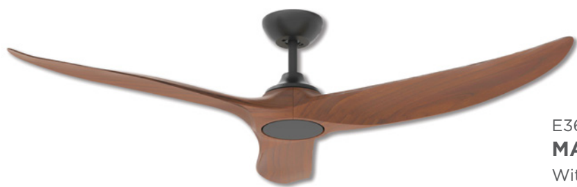
E365 MATT BLACK WITH KOA

With matt black polymer blades 1320mm (52")