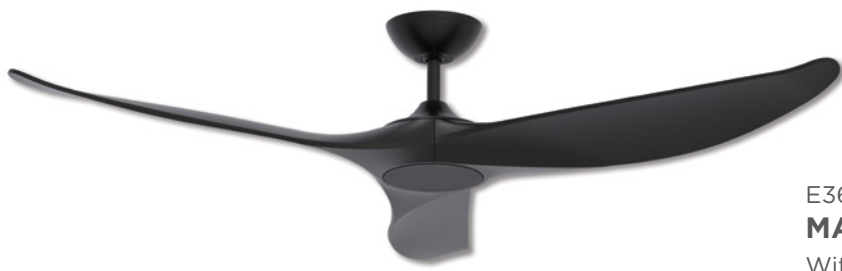
E364 MATT BLACK

With matt black polymer blades 1320mm (52")