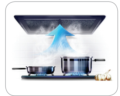
300 CFM Ventilation System