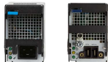
Arista 7300X Series Power Supplies

The AC power supplies are highly efficient in both platinum or titanium climate saver rated options and have an efficiency of over 93% with single stage conversion to the internal DC voltage. The DC power supplies require inputs at -48V DC to deliver up to 3000W. The 7300 Series uses multiple small power supplies which allows for incremental provisioning and smaller input circuits. Variable power supply fan speeds ensure power supply efficiency is optimized and reduces noise in data center environments.