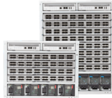
Arista 7300X Series Modular Data Center Switches

With reversible front-to-rear or rear-to-front airflow, redundant and hot swappable supervisor, power, fabric and cooling modules the system is purpose built for data centers. The 7300 Series is energy efficient with typical power consumption of under 3 watts per 10GbE port for a fully loaded chassis. All of these attributes make the Arista 7300 Series an ideal platform for building reliable, low latency, resilient and scalable data center networks. Combined with Arista EOS the 7300 Series delivers advanced features for big data, cloud, virtualized and traditional designs.