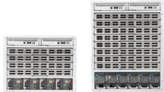
Arista 7300X Series Chassis

The midplane is completely passive and provides control plane connectivity to each of the fabric and line card modules. The system is optimized for data center deployments with front-to-rear and rear to front airflow options.