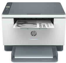
HP LaserJet MFP M234dwe Printer