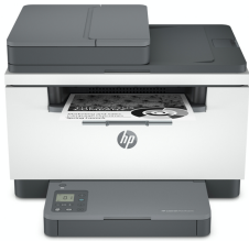
HP LaserJet MFP M234sdwe Printer

A compact multifunction printer with the fastest two-sided printing in its class 1 and the time-saving HP Smart app. 2,3 Includes HP+, the smart printing system that keeps you connected and ready to print from virtually anywhere. 2