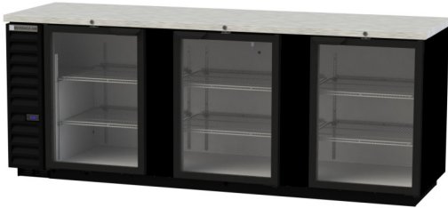
BB94HC-1-FG-B (Black model shown)