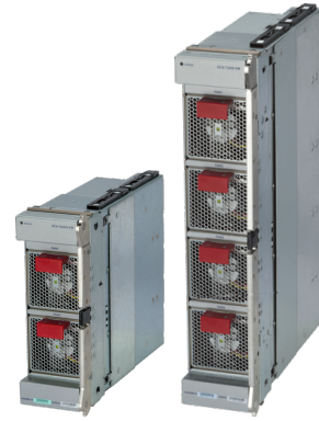
Arista 7300X3 Series Fabrics with Fans

The fabric modules for the two chassis are different based on the size of the chassis and each accommodate a set of individual hot-swap fan modules. The fan modules support forward airflow and provide redundant cooling. Each fan module can be independently replaced without any impact of the system.