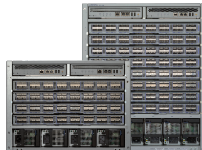
Arista 7300X3 Series Modular Data Center Switches

With optimized airflow, redundant and hot swappable supervisor, fabric, power and cooling the system is purpose built for modern networks. The 7300X3 Series is energy efficient with variable speed fans and redundant cooling. All of these attributes make the Arista 7300X3 Series an ideal platform for building high performance, open, resilient and scalable networks. Combined with Arista EOS the 7300X3 Series delivers advanced features for big data, cloud, virtualized and traditional designs.