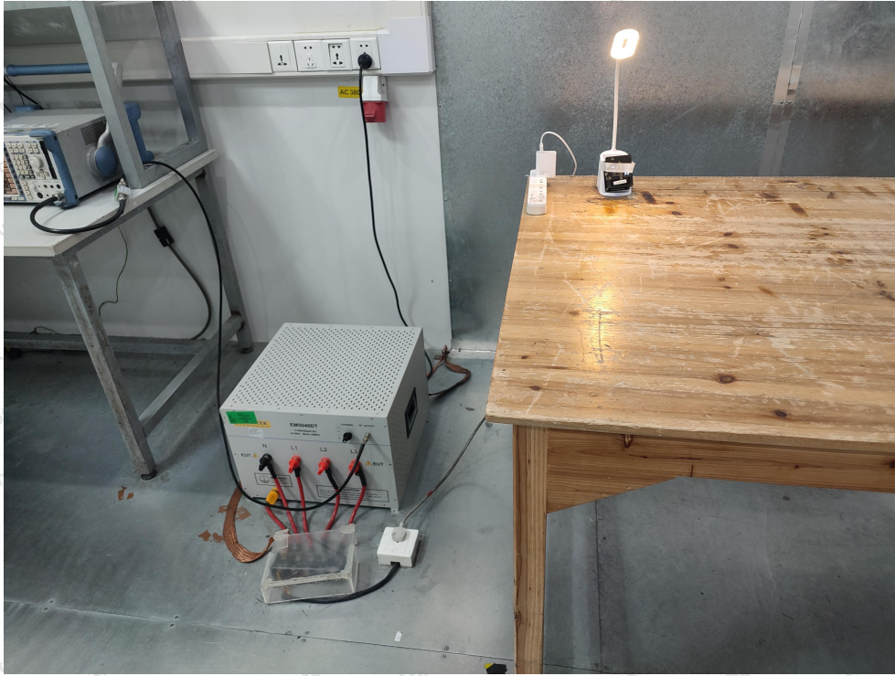
Photo of Radiation Emission Test