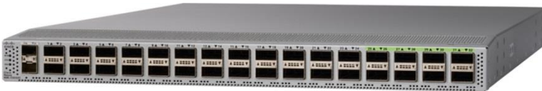
Figure 3. Cisco Nexus 9332C Switch

The Cisco Nexus 9332C is the smallest form-factor 1-Rack-Unit (1RU) spine switch for Cisco ACI that supports 6.4 Tbps of bandwidth and 2.3 bpps across 32 fixed 40/100G QSFP28 ports and 2 fixed 1/10G SFP+ ports(Figure 3). Breakout is not supported on ports 1 to 32. The last 8 ports marked in green support wire-rate MACsec encryption 2 .