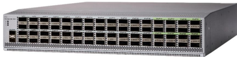
Figure 2. Cisco Nexus 9364C Switch

The Cisco Nexus 9332C is the smallest form-factor 1-Rack-Unit (1RU) spine switch for Cisco ACI that supports 6.4 Tbps of bandwidth and 2.3 bpps across 32 fixed 40/100G QSFP28 ports and 2 fixed 1/10G SFP+ ports(Figure 3). Breakout is not supported on ports 1 to 32. The last 8 ports marked in green support wire-rate MACsec encryption 2 .