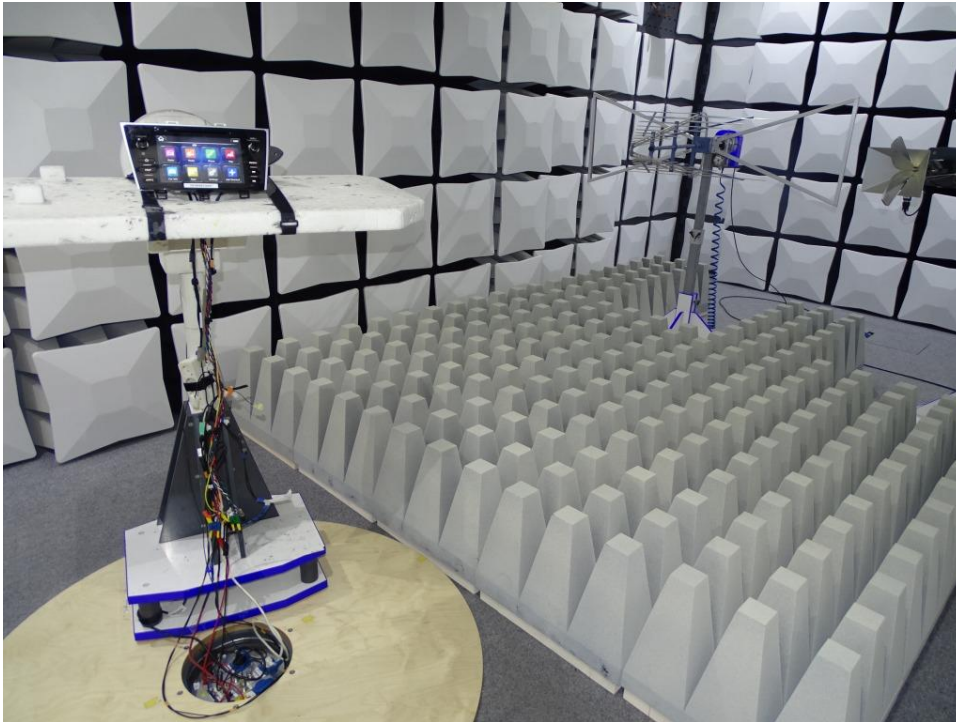
Photo 3: Test setup for radiated measurements (Enclosure, fully-anechoic chamber, 1-25 GHz intentional radiator §15, ANSI C63.10)