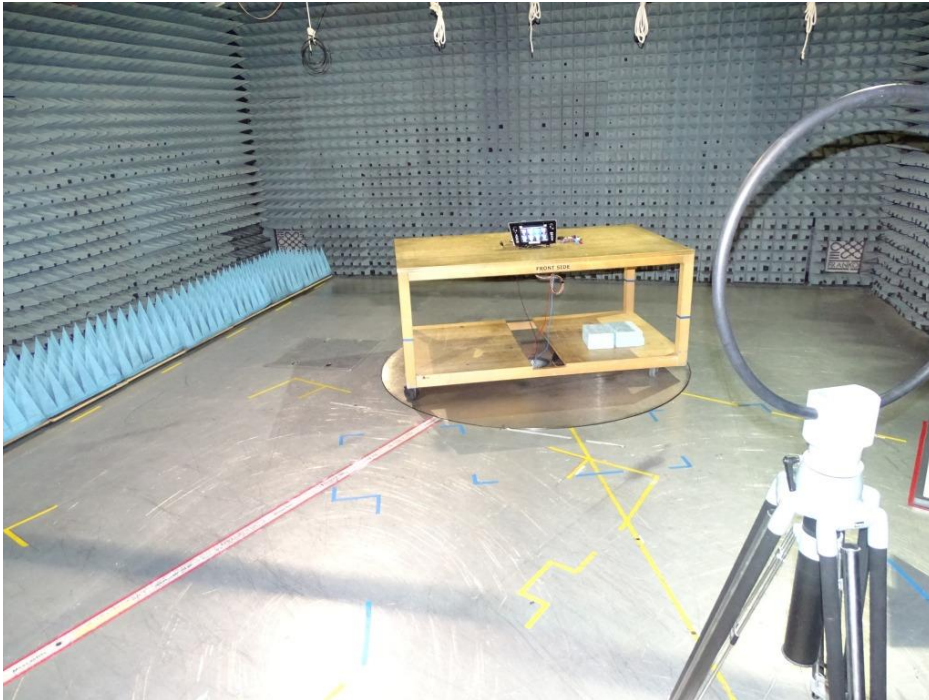
Photo 1: Test setup for radiated measurements (Enclosure, below 30 MHz, intentional radiator §15, ANSI C63.10)