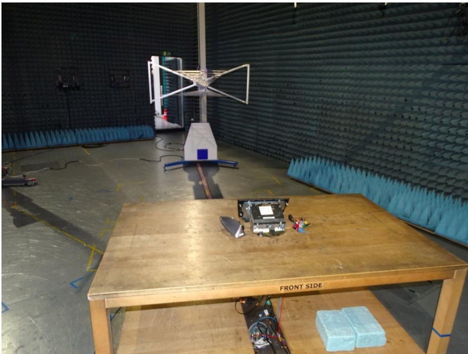
Photo 2: Test setup for radiated measurements (Enclosure, semi-anechoic chamber, 30 MHz to 1 GHz, intentional radiator §15, ANSI C63.10)