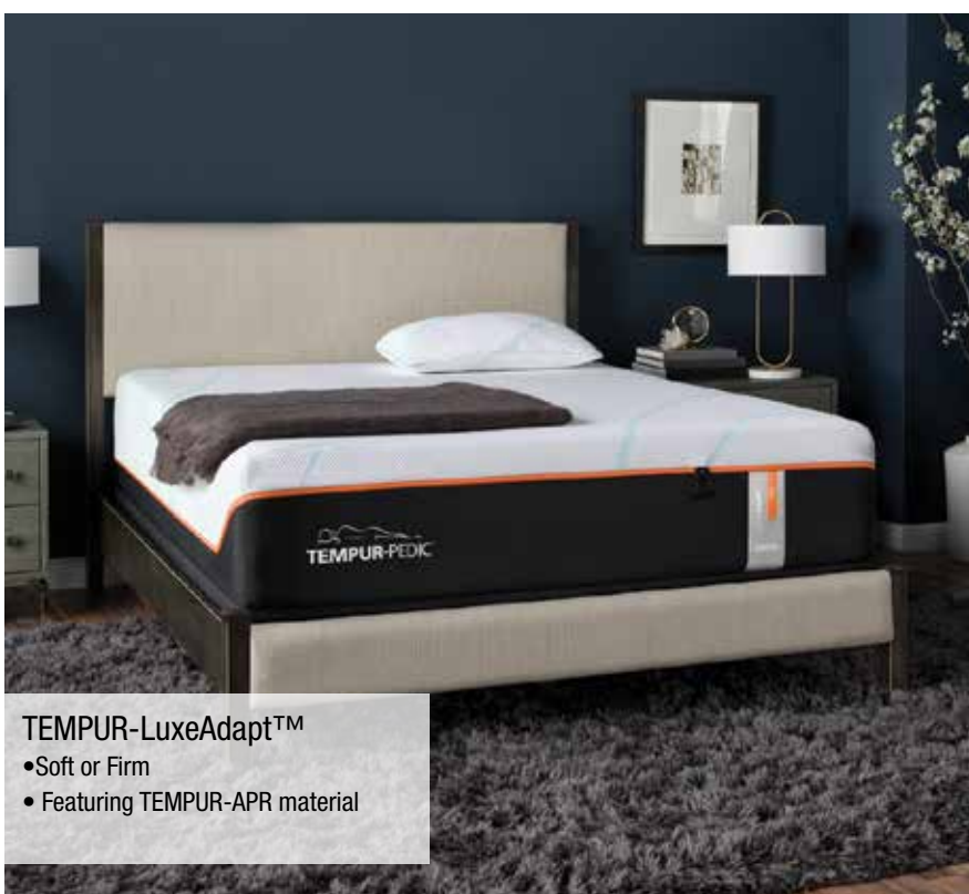
TEMPUR-LuxeAdapt™ • Soft or Firm • Featuring TEMPUR-APR material

0% INTEREST FOR 24 MONTHS* *When paid in full on qualifying purchases with select financing companies made now through March 13th, 2024. Interest will be charged to your account from the purchase date if the promotional balance, including optional charges, is not paid in full within 24 months or if you make a late payment. Equal Monthly Payments Required. See back page for details.