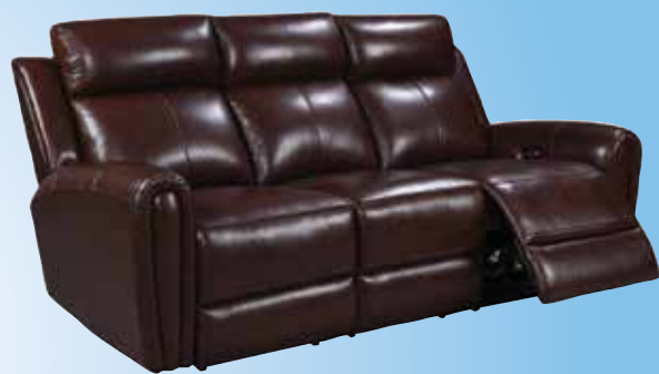
ROYCE Leather Power Reclining Sofa with USB Charging Port