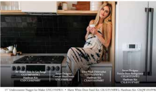
15" Undercounter Plug-in for Maker UNCS150PR1 • Matt White Door Panel Kit: CR15PW001L Hardware Kit: CQ0W1H1P02