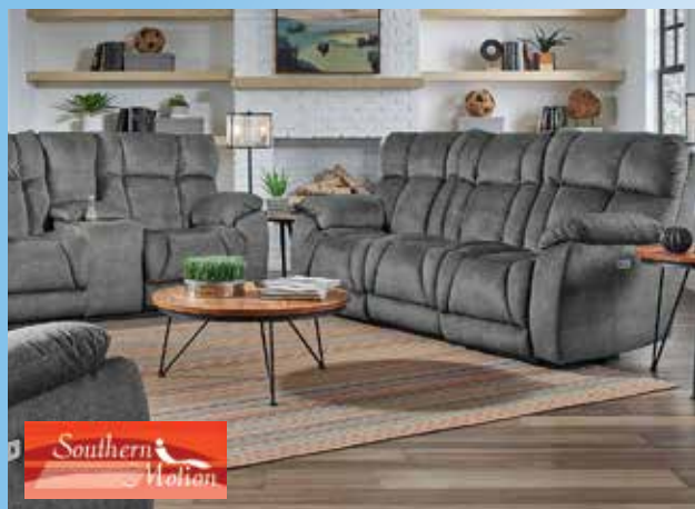
WILD CARD Reclining Sofa