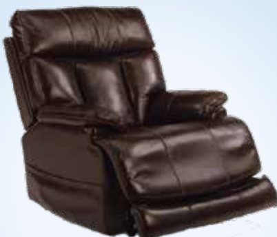
CLIVE Leather, Power Headrest & Lumbar, Extended Footrest