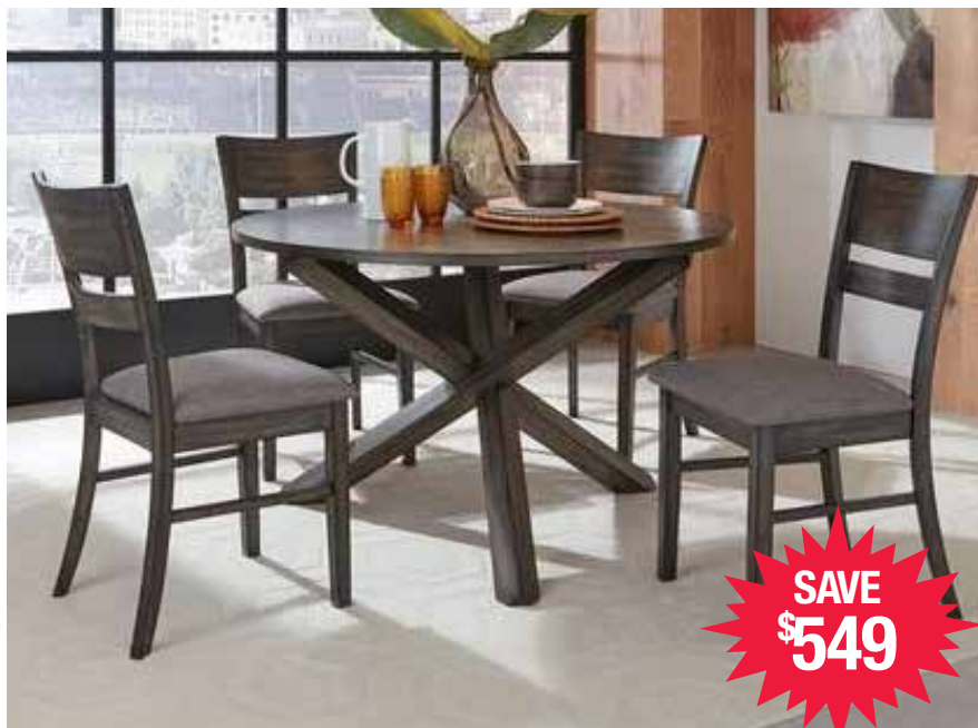
LIBERTY ANGLEWOOD 5 PIECE PEDESTAL TABLE SET

Feel comfortable and elegant at the same time. Includes pedestal table and four slat back upholstered side chairs.