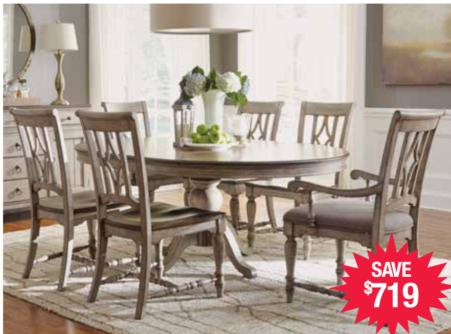
PLYMOUTH 7 PIECE DINING SET Includes round to oval table, 4 side chairs and 2 arm chairs.

**with qualifying furniture purchase. See store for details.