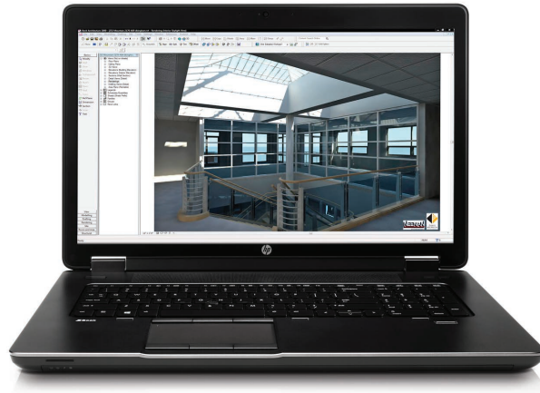
HP ZBook 17 Mobile Workstation

Inspire creativity with the incredible expandability of HP's most powerful mobile workstation.