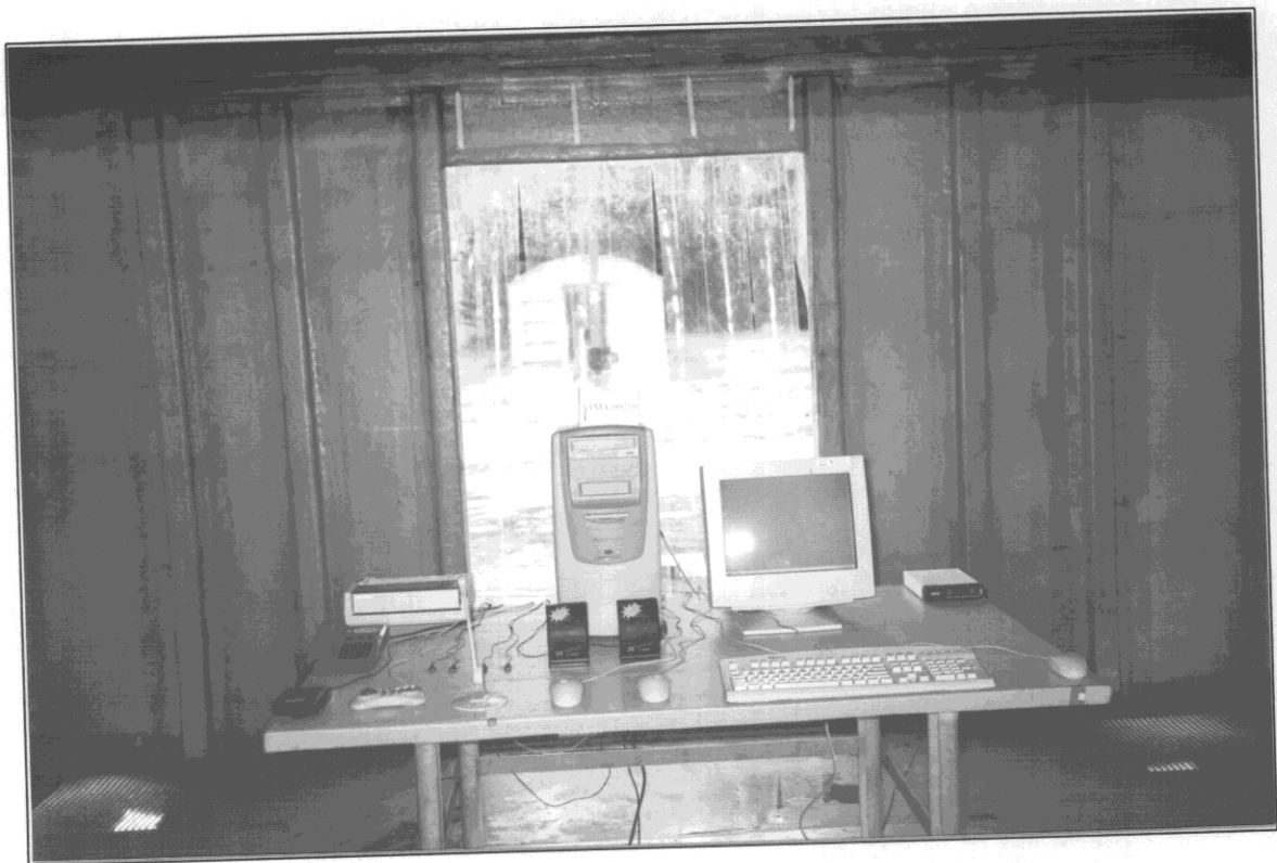
FRONT VIEW OF RADIATED TEST