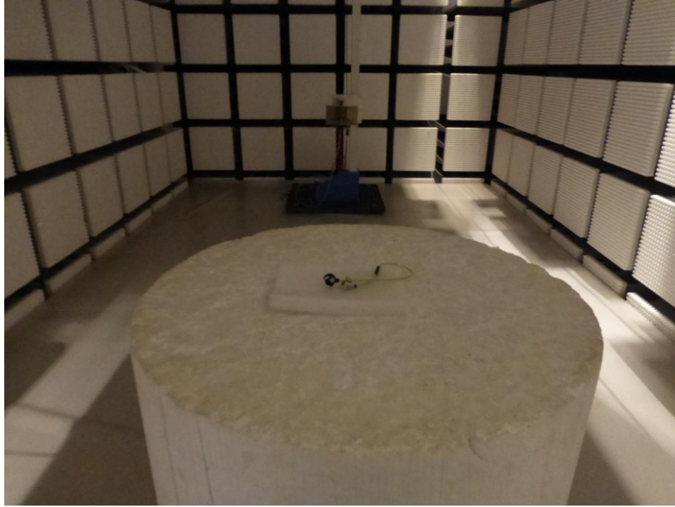
Radiated Emission Above 1GHz