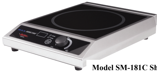
Model SM-181C Shown