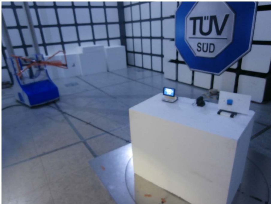
Radiated Emissions 30 MHz to 1 GHz