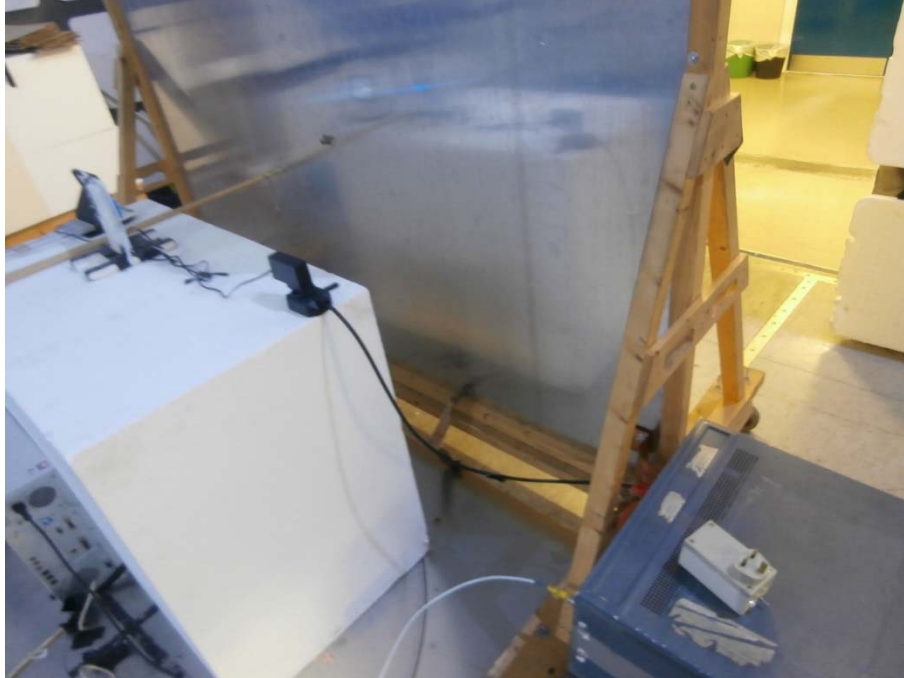
Conducted Emissions 150 kHz to 30 MHz