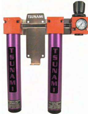
2-Stage Filtration - 50 CFM