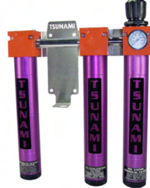
3-Stage Filtration - 50 CFM