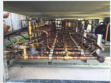
Refrigeration Circuits (below a condenser of a LINK+)

KEEPRITE REFRIGERATION Brantford, Ontario — Longview, Texas