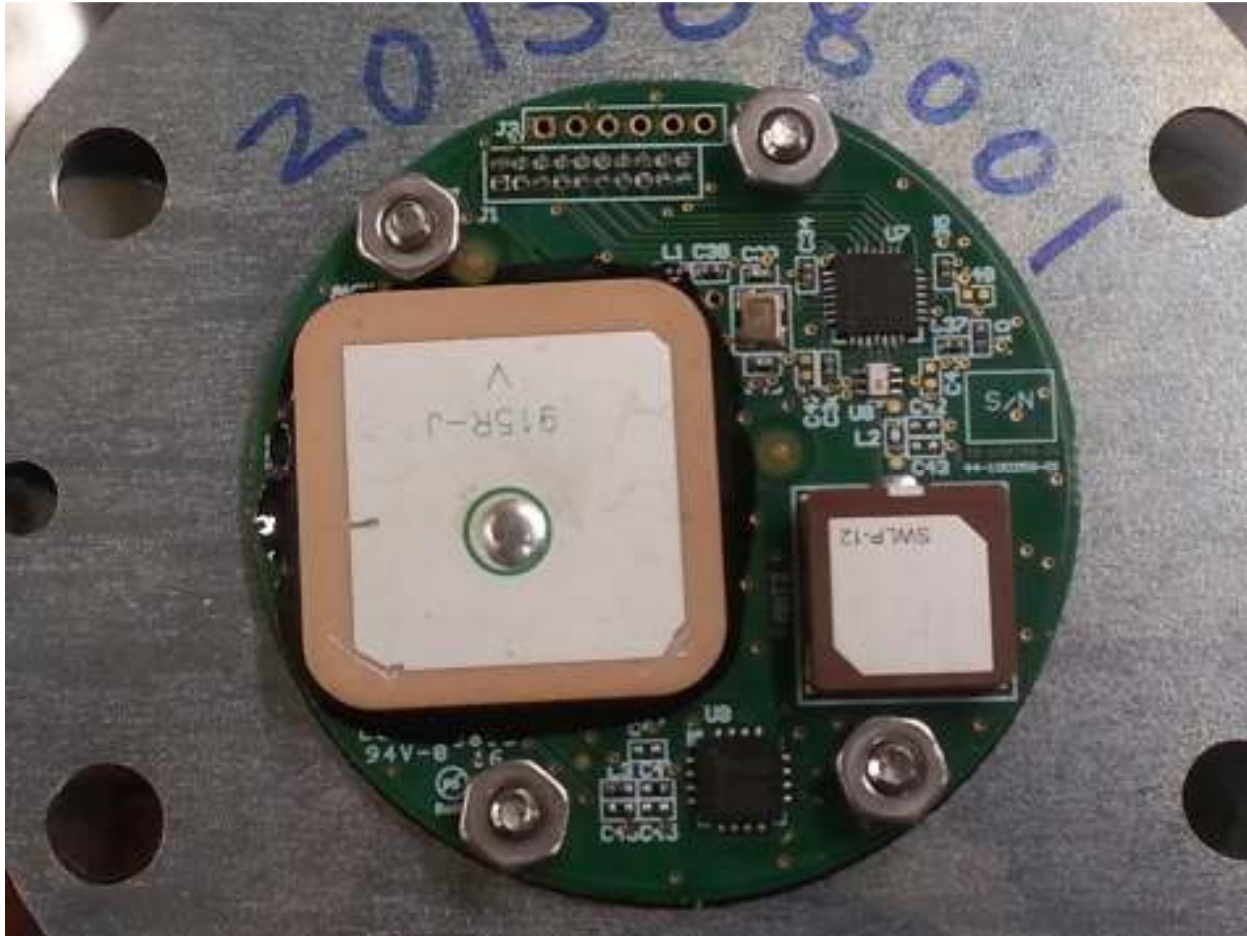
Figure 3: Image of antenna mounted on Oil Sensor PCB