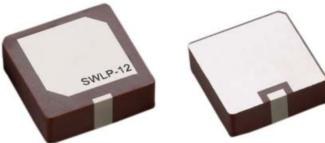
Figure 2: Stock images of SWLP.2450.12.4.B.02 from datasheet.