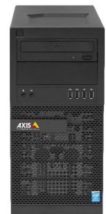
AXIS S9001 Desktop Terminal sold separately