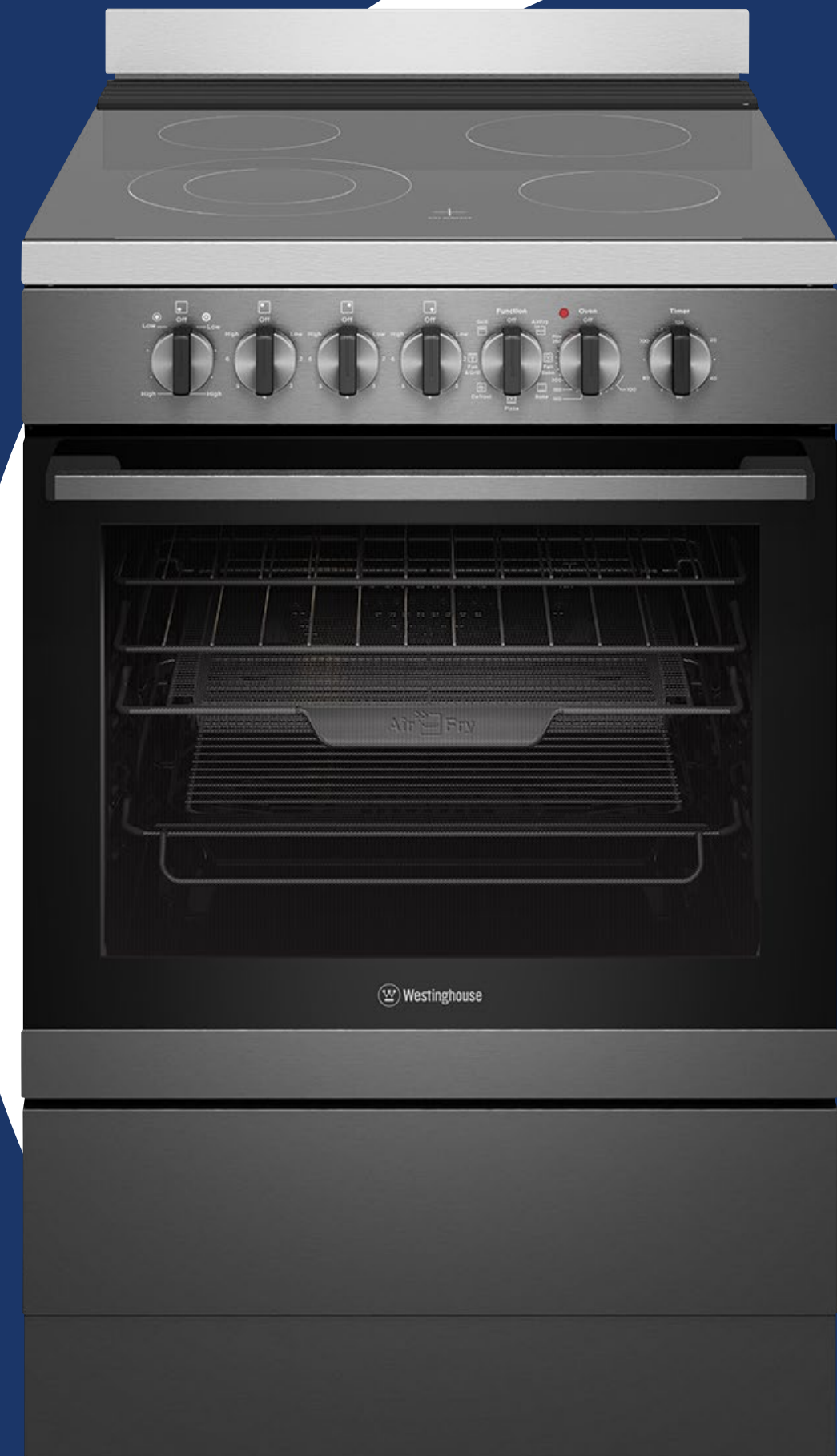
Model shown: WFE646DSC

Whatever your choice, it's ready to slot right into your kitchen and right into your life, making everyday cooking a pleasure, not a chore.