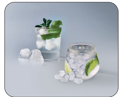
Dual Ice Maker with Ice Bites™