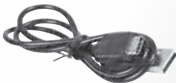
USB-A to USB-C Charging Cable