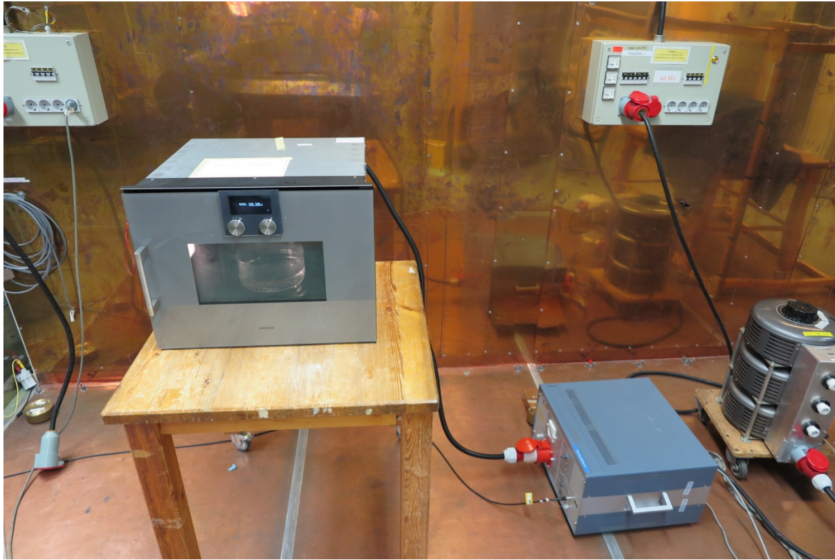
Photo of the test set-up for conducted emission