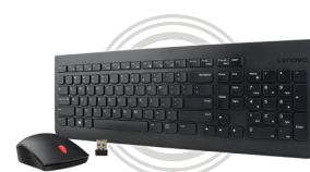
Lenovo 510 Wireless Combo Keyboard & Mouse