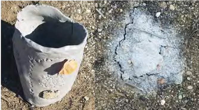
Left: before rain; Right: after rain.

You may have heard about the new (Re)place sculpture exhibit in the last Oak Notes, or even seen some of the sculptures scattered throughout the Garden. The original installation and exhibit opening took place back in early November, but the exhibit is actually still growing!