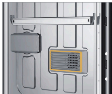
Smart Dry with AutoRelease™ Door

Fingerprint Resistant Black Stainless Steel