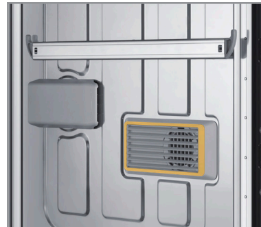
SmartDry™ with AutoRelease™ Door