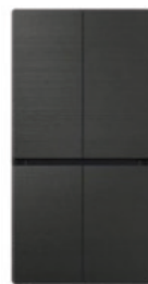
Matte Black Steel