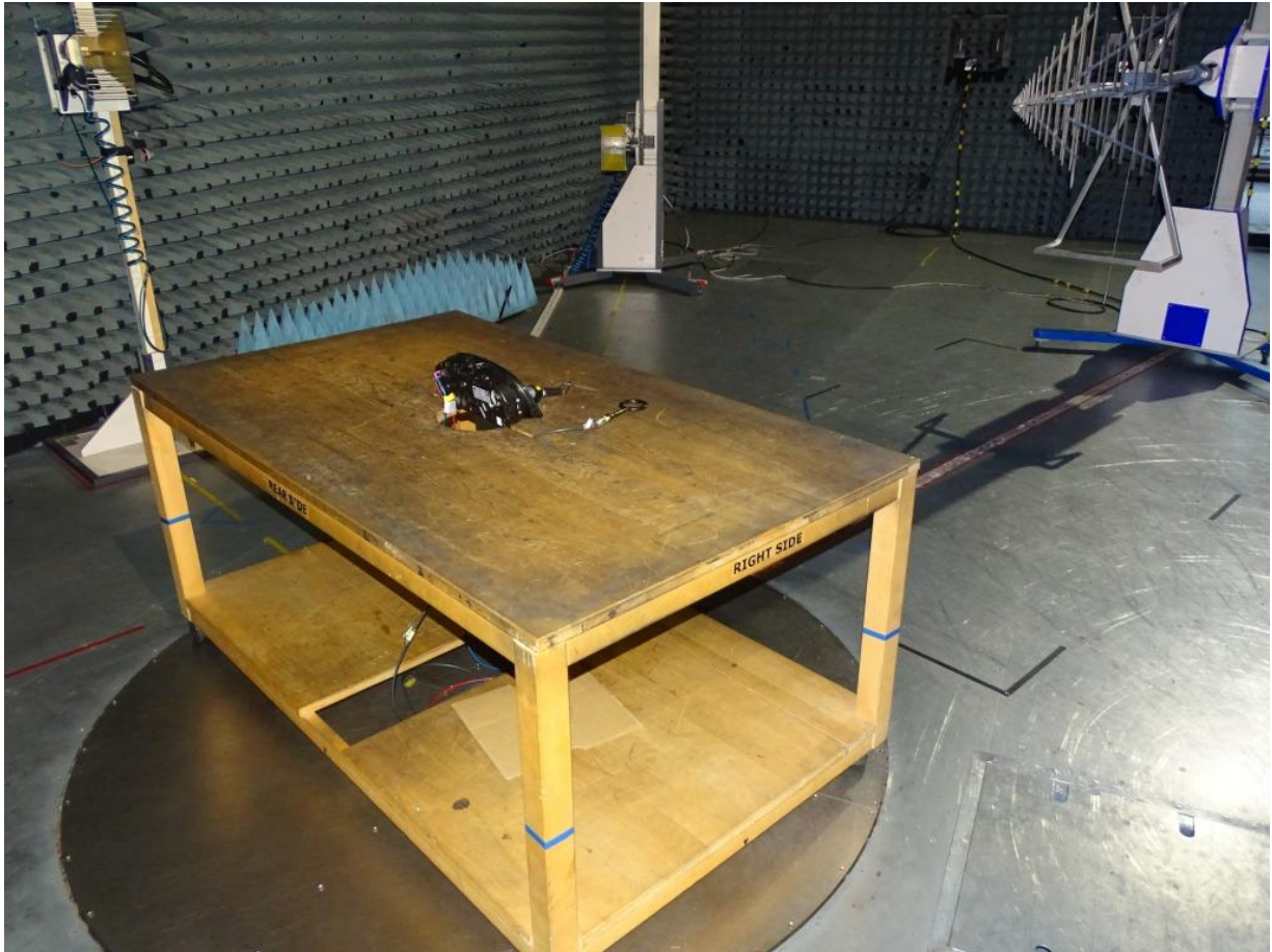
Photo 2: Test setup for radiated measurements (Enclosure, semi-anechoic chamber, 30 MHz to 1 GHz, intentional radiator §15.209, ANSI C63.10)