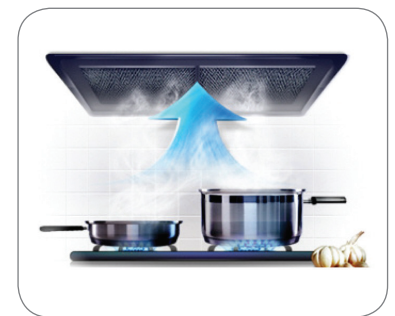
300 CFM Ventilation System