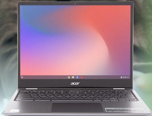
Acer Chromebook Spin CP713-2W-5874 powered by an Intel Core i5-10210U processor

We compared two Chromebooks: an Intel® Core™ i5-10210U processor-powered Chromebook from Acer and a MediaTek Helio P60T processor-powered Chromebook from Lenovo®. The graphs below show how each Chromebook performed while completing a sequence of tasks during a four-way Google Meet™ call.