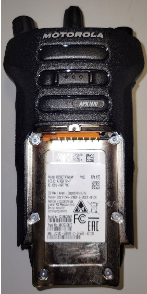
Back View (FCC/IC label) location (Model: H35UCT9PW8AN)