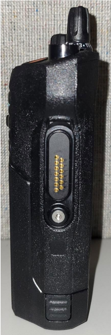
Side View (Left) with Battery