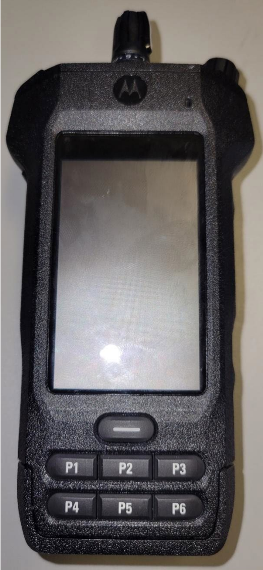
Front view with battery