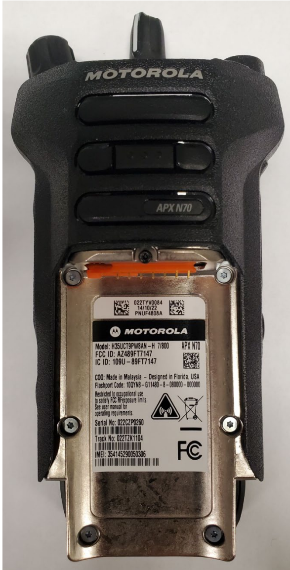
Back View (FCC/IC label) location (Model: H35UCT9PW8AN-H)