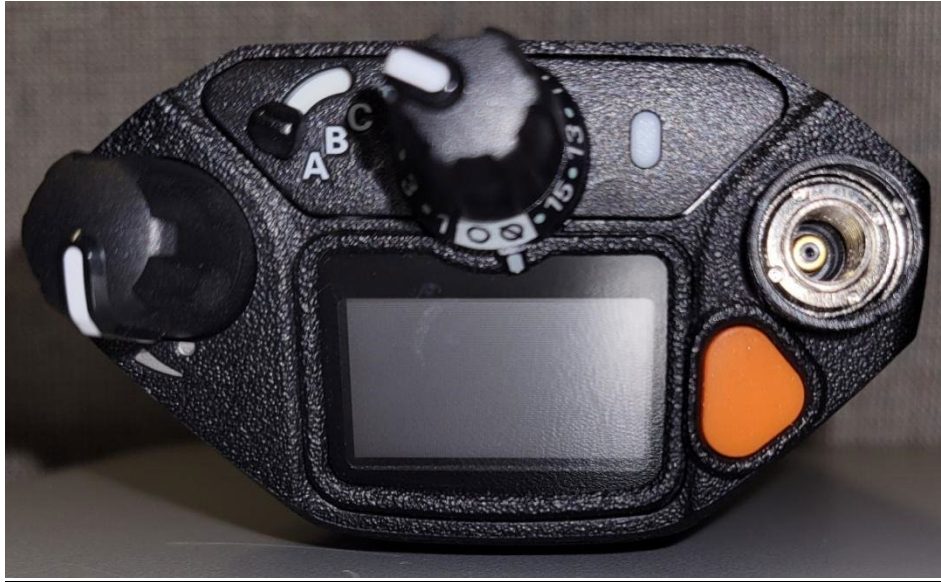
Top View with Battery