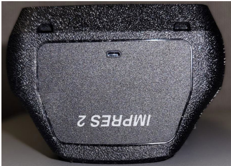
Bottom View with Battery