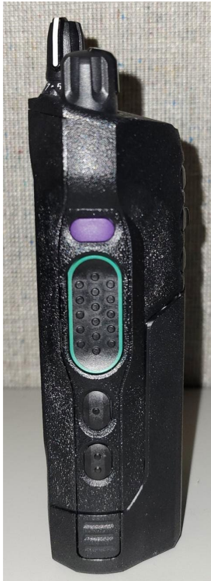
Side View (Right) with Battery