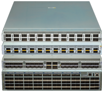
Arista 7280R3 Series