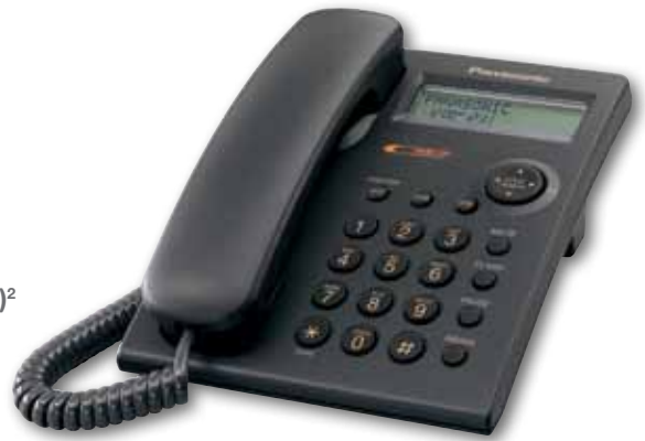
Available in Black or White