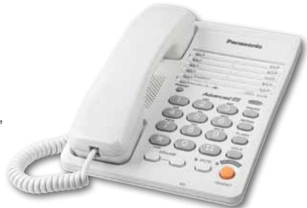
Available in Black or White