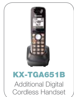
KX-TGA651B Additional Digital Cordless Handset