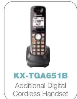
KX-TGA651B Additional Digital Cordless Handset