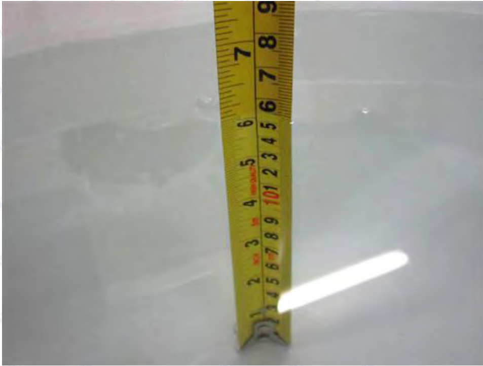
Liquid depth :15.5cm