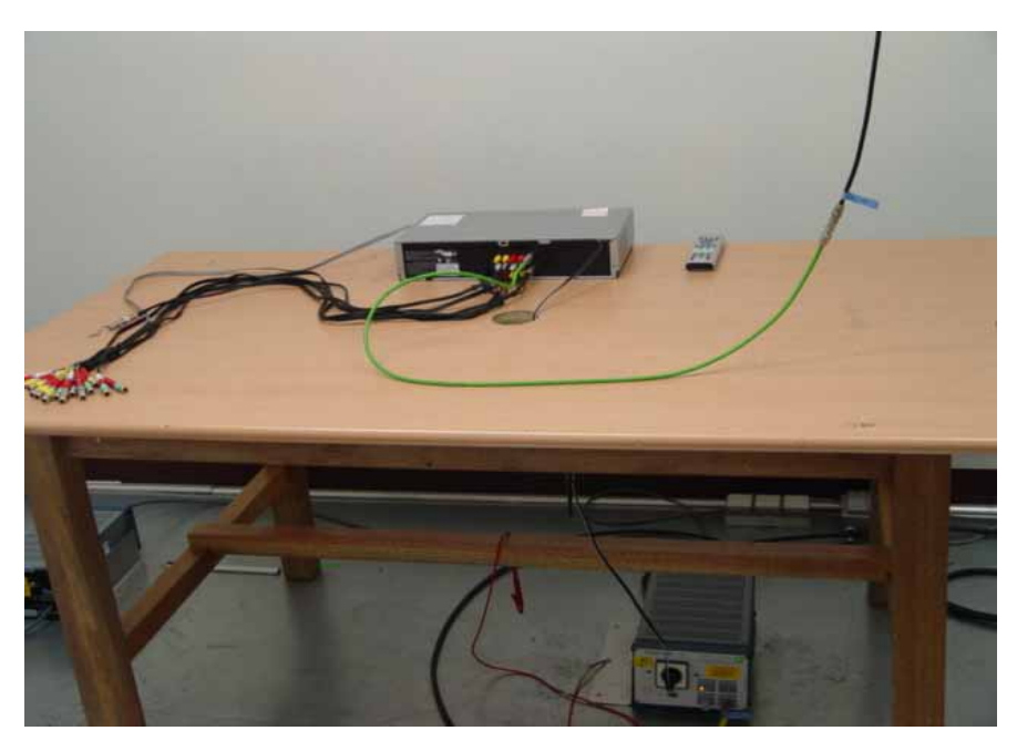
Conducted Emission (Front) Picture