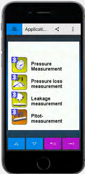
Example on your Smartphone