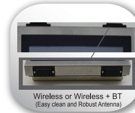
Wireless or Wireless + BT (Easy clean and Robust Antenna)