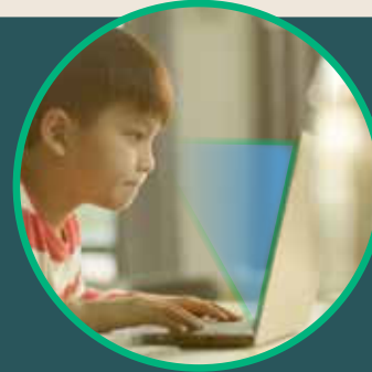
Eye Care Feature