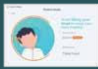
"Please sit upright - Posture Reminder"