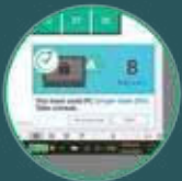
"Take Time out - Break Reminder"

Parents can get a holistic overview of their children's digital usage through Lenovo Aware , which provides a daily report with statistics on posture, viewing distance, energy and focus levels.