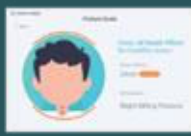
"You are too close - Distance Reminder"