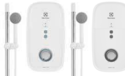
EWE361KB-DWB6 DC Pump