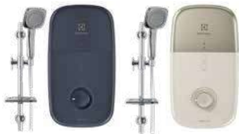
EWE361LB-DIX4 DC Pump