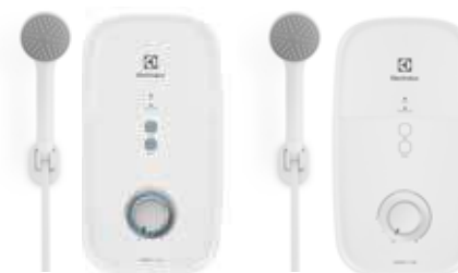
EWE361KX-DWB5 No Pump