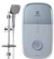
EWE361LX-DBX4 No Pump