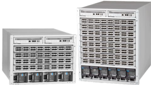
Arista 7300 Series