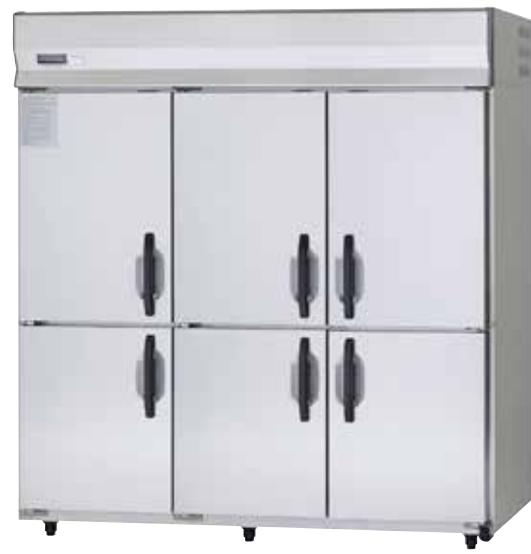
3 DOOR SPLIT DOOR SRF-1881HP(AUS)

EXTERNAL DIMENSIONS: W1800 x D800 x H1995mm*