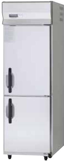
SINGLE SPLIT DOOR SRR-681HP(AUS)

EXTERNAL DIMENSIONS: W620 x D800 x H1995mm*