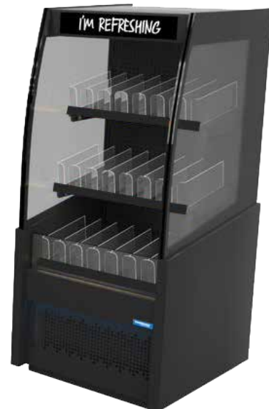
BEVERAGE UNIT SGN141s*

EXTERNAL DIMENSIONS: W650 x D719 x H1400mm