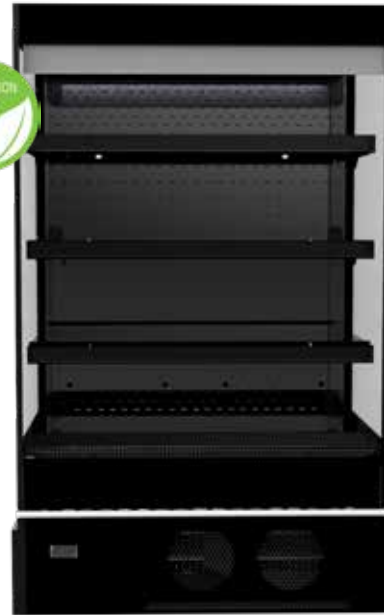
MULTI-DECK SELF CONTAINED CHILLER CABINET H1A*

EXTERNAL DIMENSIONS: W1243 x D895 x H2065mm