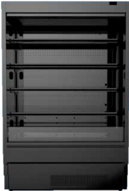
SELF CONTAINED UPRIGHT CHILLER CABINET HITMS-10/14/19/26*

EXTERNAL DIMENSIONS: W 1020/1330/1960/2600 D860 x H2090mm