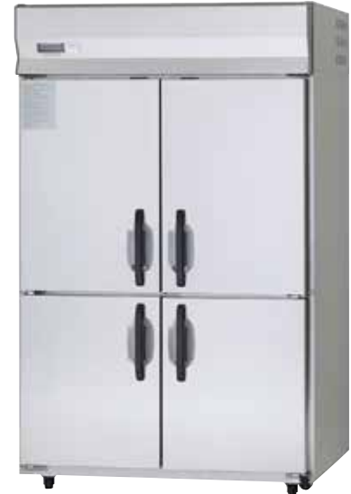
2 DOOR SPLIT DOOR SRF-1281HP(AUS)

EXTERNAL DIMENSIONS: W1210 x D800 x H1995mm*