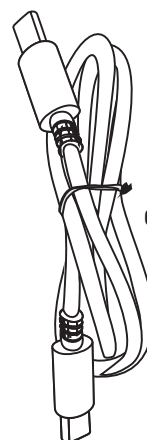
USB-C Charging Cable